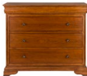
4 Drawer Chest H:91 W:115 D:48 LI/8570L