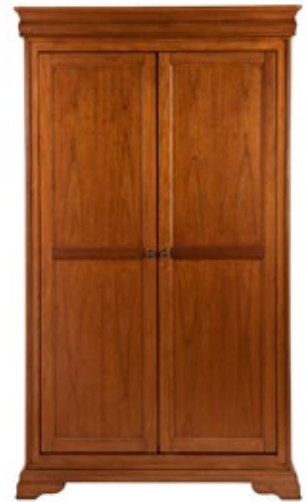
All Hanging Wardrobe H:197 W:117 D:64 LI/8568L