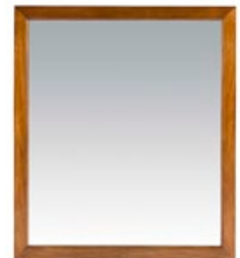
Wall Mirror H:110 W:90 D:3 LI/8576L

A fresh finish formed from solid Poplar and Cherry veneer finds this classic W&G range revived. Available in a light brandy mid tone finish, giving Louis Philippe a new start as its warmth of character and timeless sophistication springs back into life.