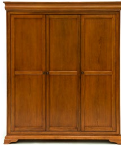
Triple Fitted Wardrobe H:197 W:176 D:64 LI/8567L