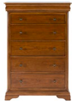
Tall 6 Drawer Chest H:133 W:90 D:50 LI/8574L