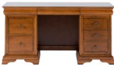
Dressing Table H:77 W:150 D:48 LI/8571L