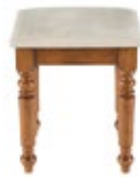
Stool H:49 W:43 D:43 LI/8572L