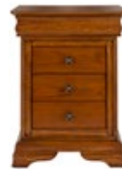
3 Drawer Bedside H:70 W:50 D:42 LI/8566L