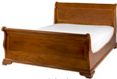
Bedstead 150cm | H:102 W:164 D:220 | LI/8561L 180cm | H:102 W:183 D:220 | LI/8562L