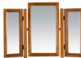
Gallery Mirror H:68 W:96 D:20 LI/8573L