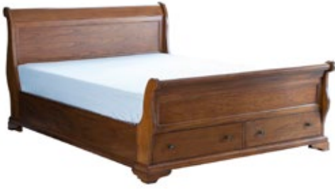
End Storage Bedstead 135cm | H:102 W:149 D:220 | LI/8563L 150cm | H:102 W:164 D:220 | LI/8564L 180cm | H:102 W:183 D:220 | LI/8565L