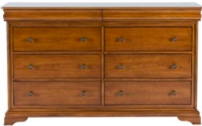
4+4 Drawer Chest H:91 W:160 D:48 LI/8569L